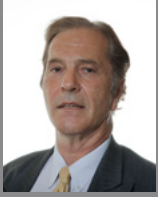
Lord Howard Flight former Shadow Chief Secretary to the Treasury