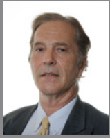
Lord Howard Flight former Shadow Chief Secretary to the Treasury